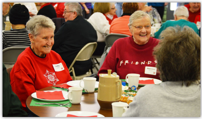
<u>Community Connections</u> is a popular community outreach program for senior citizens in the District.