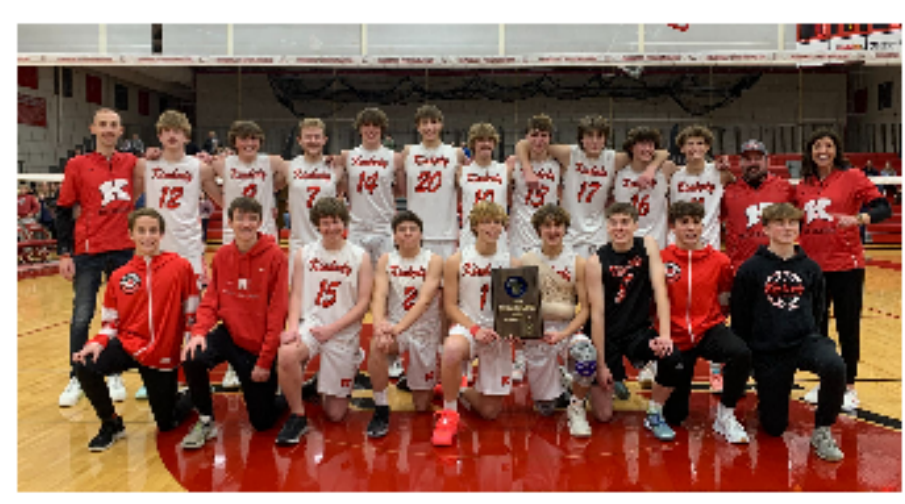
KHS Boys Volleyball Announces Annual Youth League

The annual boys volleyball youth league will begin soon at JRG in Kimberly. This is for boys in 7th or 8th grade in the area. We will practice at least once per week with games 1 or 2 times per week. Games are in the Fox Valley. We will play against teams from Appleton, Kaukauna, Fond du Lac, Neenah and Green Bay. The league will end with a tournament.