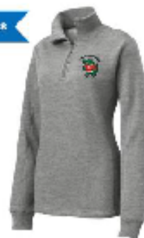
SanMar LS1253 Sport-Tek® Ladies 1/4-Zip Sweatshirt $42.00