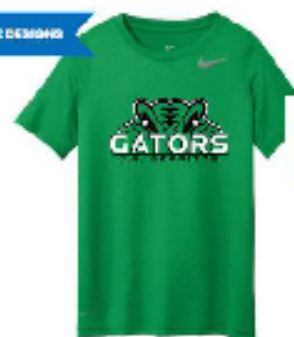
Nike Ladies Legend Tee $31.00