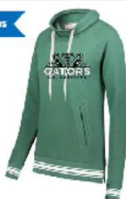
Ivy League Funnel Neck