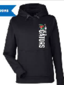
Alpha Hoodie - 1370425 Under Armour Ladies Storm Armour Starting At $68.00