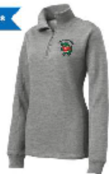
SanMar 181253 Sport-Tek™ Ladies 1/4-Zip Sweatshir... $42.00