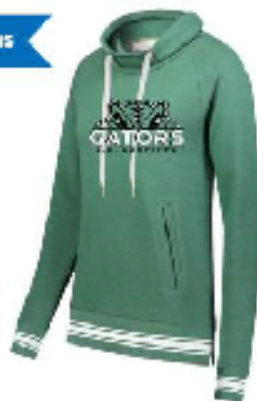
Ivy League Funncl Neck