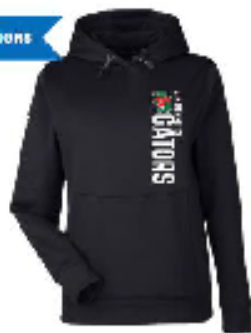
Alpha Hoodie - 1370426 Under Armour Ladies Storm Armour Starting At $58.00