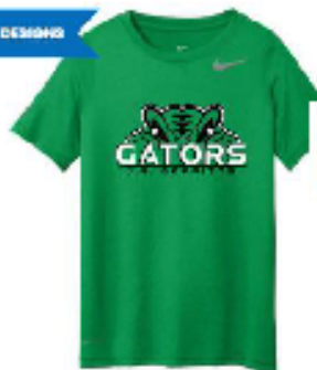
Nike Ladies Legend Tee $31.00