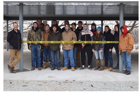
The Building Construction 2 class, part of the ACE Academy, completed a new park shelter in Sunset Park in January.