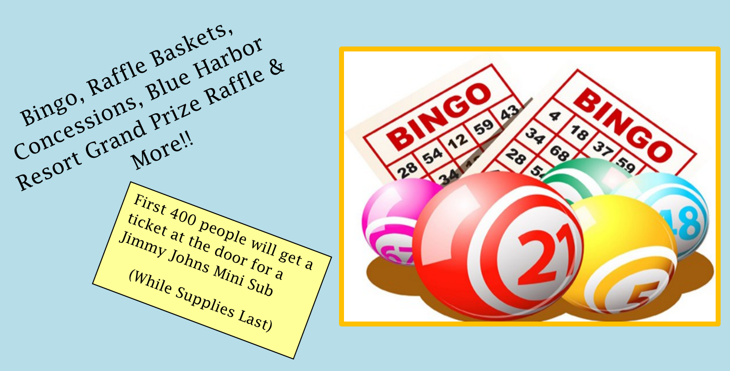
All students attending must have a parent present. PTO is not responsible for your child.

Friday, April 6<sup>th</sup>, 2018 Doors Open: 5:30 p.m. First Game Starts: 6:00 p.m. (Sharp!!)